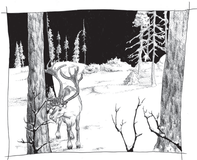
THE ILLAWEN a fable of early empire

shadow the Jakkioleenna as they traveled. Before they left, Illakes went to the tent of her mentor. While the high priestess slept, her student crept upon her, bone dagger in hand. The older woman's eyes shot open and saw for the last time. Illakes spoke: "You ought not have allowed this." THE JOURNEY WAS A DANGEROUS ONE FOR THE CHILDREN. THEY HAD LITTLE to eat and only their passion for warmth, but the moon cast light on them and they never wavered from their path. With unforeseeable haste they came upon the trail of the Jakkioleenna , and the Illawen set about their work. When a tribe was on the move, one man was given the role of ember-bearer. He carried a special shell wrapped in hide, which bore embers as seed for the next night's fires. The Illawen sent a scout to identify the carrier of the ceremonial coal, and the next day they struck. As the ember-bearer walked past a cliff, an elder girl from among the Illawen cast a spear into his leg with her atlatl. The Jakkioleenna hunters set out at once to find the antagonist, but the girl hid in the recess of a tree too small for a full-grown man. She thus remained unnoticed.